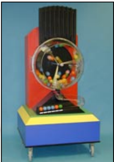
Uthingo's Criterion II in its bold South African colors.

Lottery of South Africa followed suit. Having launched the National Lottery with a Beitel Criterion in '99. They have since upgraded to Smartplay's Criterion II.