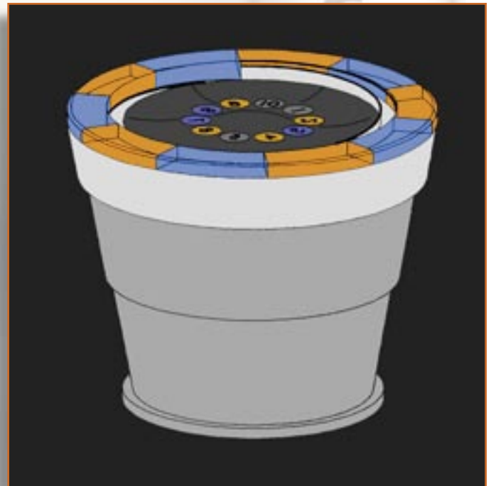
Artist's rendering, Luxembourg's PiccoBello gaming table.

Loterie Nationale, Luxembourg has recently contracted with Smartplay to replace their PiccoBello prize wheel with a custom gaming table. Since introduction of PiccoBello in 02, a distinctive wheel made by Smartplay has stood front and center. Custom designed in collaboration with lottery management, the elaborate wheel spins one way, while a pointer goes in the opposite direction. Lighting follows the spin of the wheel, as the prize segments illuminate in a captivating chase pattern.