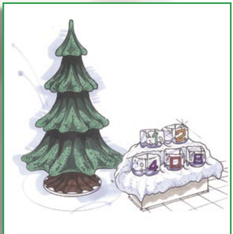
Smartplay's conceptual rendering of set pieces.

The object of the game is to first crack a five-digit code by placing in correct order, five frosty looking, 15" acrylic ice cubes into a glossy white snow bank. Each cube bears