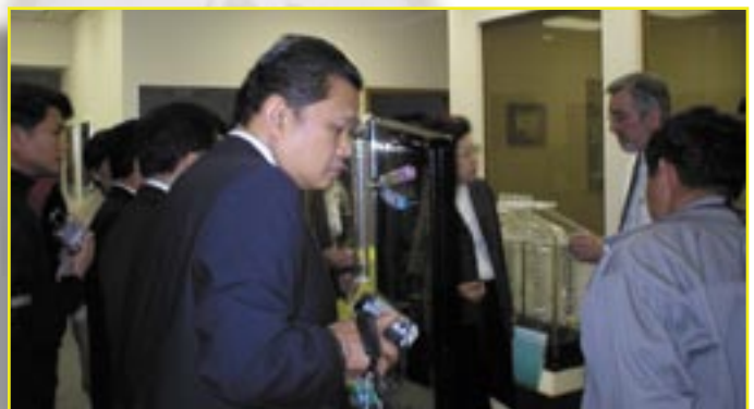
The Government Lottery Office of Thailand sent a large delegation to tour Smartplay.

Perhaps most frequently, foreign clients invest by sending a technician for Smartplay's free technical/operational training, just prior to shipment. In this invaluable practicum, one-on-one training is